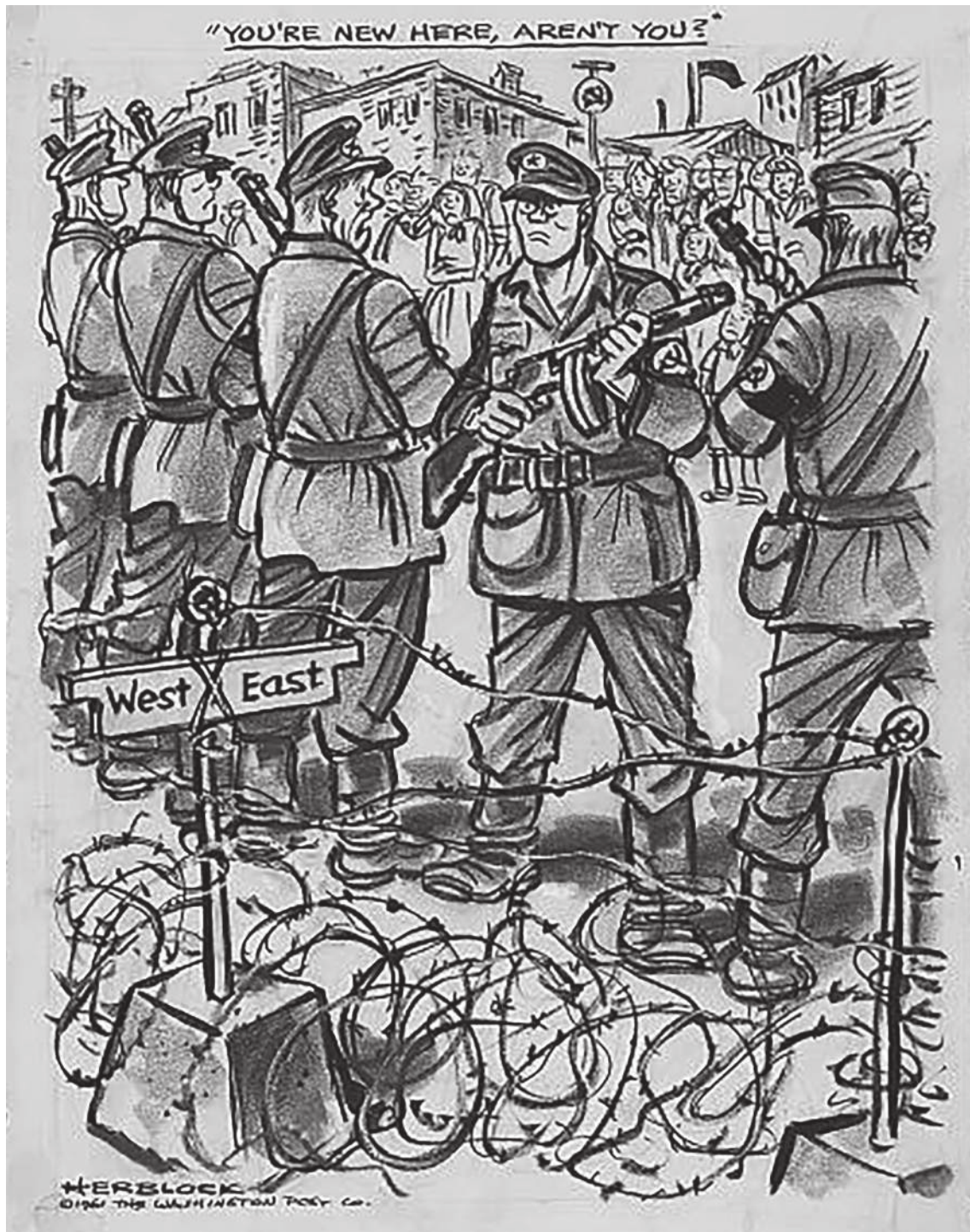
A cartoon published in an American newspaper, 30 August 1961.